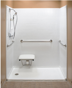
Shown above is our Model AB-6031BF wheel chair accessible system with a left drain location.