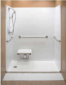
Shown above is our Model AB-6030BF wheel chair accessible system with a left drain location.