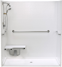
Shown above is our Model AB-6232BF wheel chair accessible system with a center drain location.