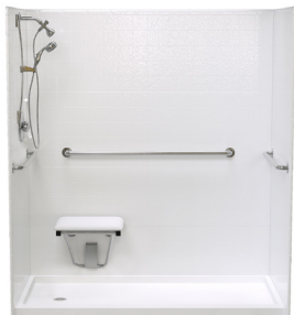
Shown above is our Model AB-6032NWC esystem with a left drain location